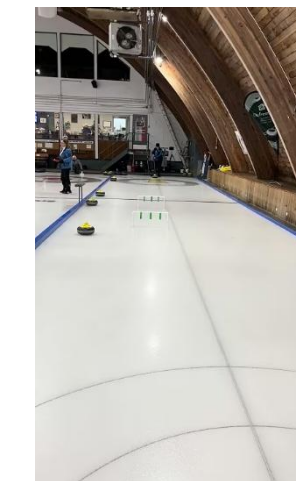
View from the broom